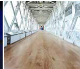
Tower Bridge in London Bona ClassicSeal + Bona Traffic