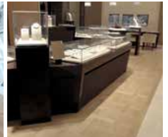
Bulgari shop in Singapore Bona IntenseSeal + Bona Traffic Naturale