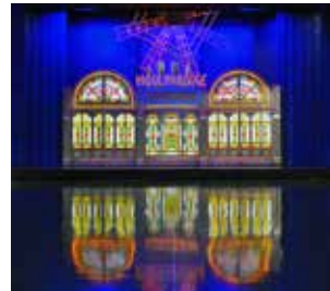
Moulin Rouge in Paris Bona IntenseSeal + Bona Mega

That's why Bona protects millions of square feet of floors in the toughest and most prestigious places throughout the world. Choose the Bona System® and enjoy an exceptional result every time. It's as simple as that.